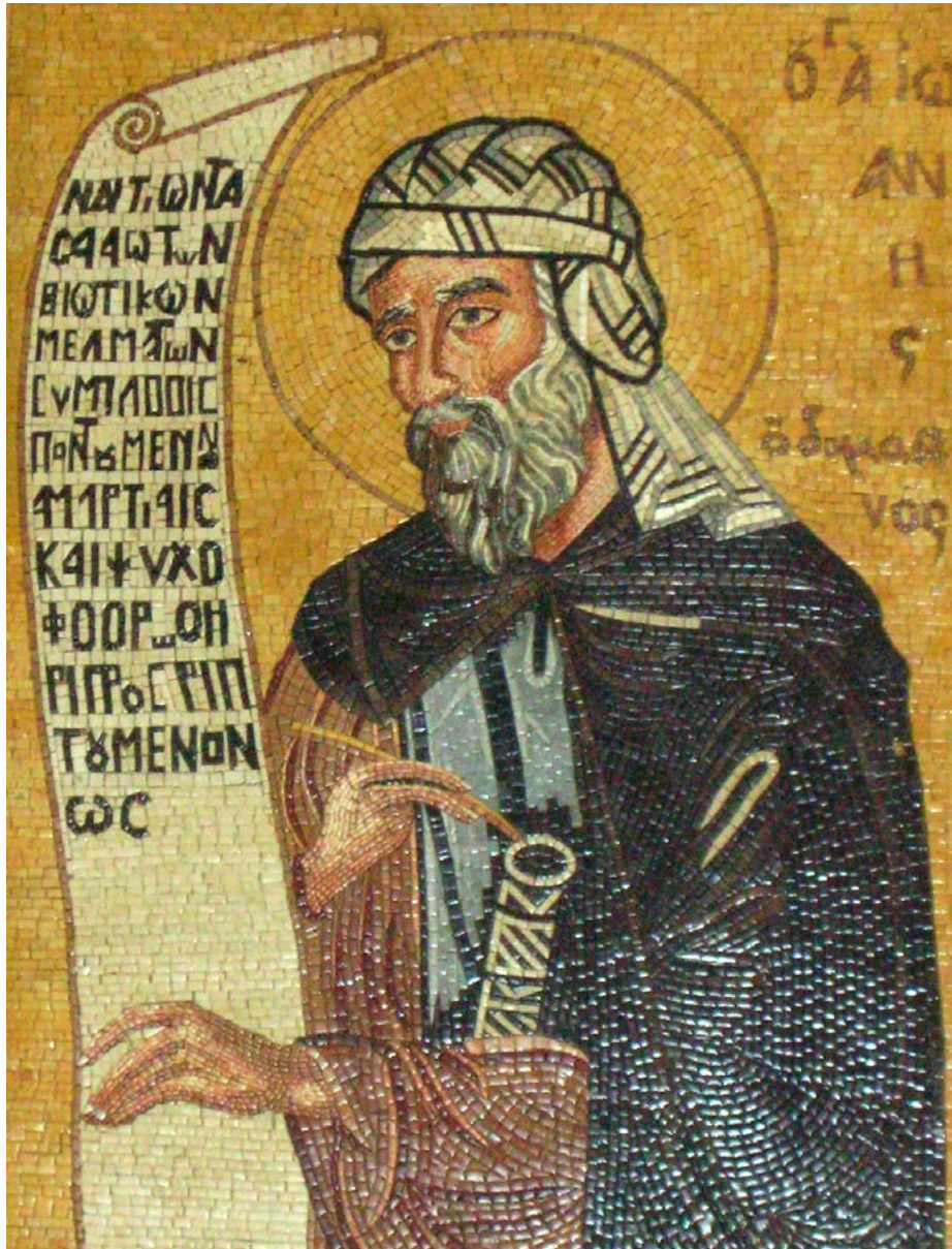
Mosaic detail, Jordan.