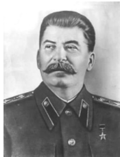
Josef Stalin, murderer of 60 million