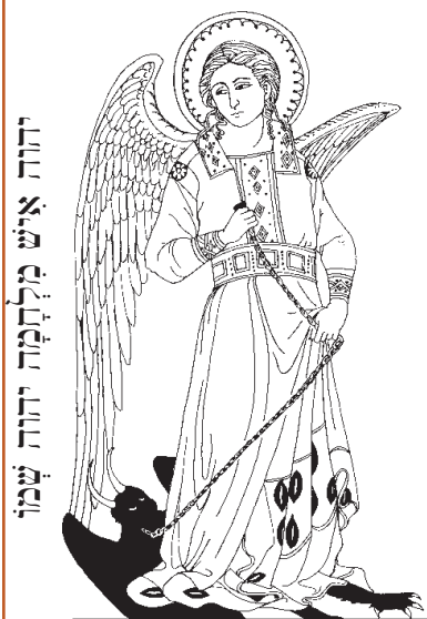
Ex. 15.3 The LORD is a warrior; the LORD is his name.

Psa. 81.13 “If my people would but listen to me, if Israel would follow my ways, 14 how quickly would I subdue their enemies and turn my hand against their foes! 15 Those who hate the LORD would cringe before him, .... 16 But you would be fed with the finest of wheat; with honey from the rock I would satisfy you.”